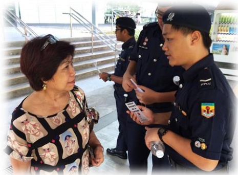
Our NPCC cadets advocating crime prevention messages to members of the public

The National Police Cadet Corps Unit Overall Proficiency Award (UOPA) is conferred annually by the NPCC HQ. It is awarded by assessing the overall performance of NPCC school units in a work year. All NPCC secondary school units will participate in the assessment process.