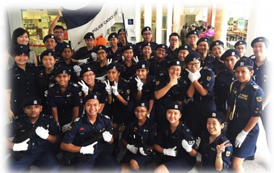
Our NPCC marching contingent for National Day school parade

We would also like to extend our thanks to Punggol Neighbourhood Police Centre for collaborating with us for crime prevention projects.