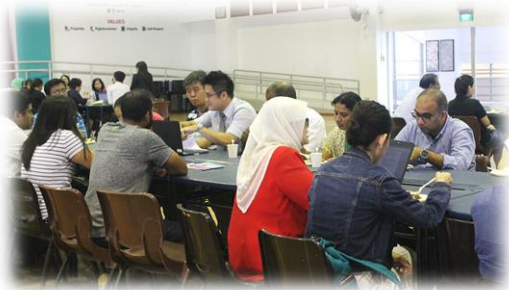
Our teachers interacting with parents

Following that, parents had the opportunity to meet up with form teachers and key personnel to find out more their child’s progress. It was also a platform to inform parents of various support avenues, such as the Parent Support Group and Family Matters @ School Programme. In addition, parents also clarified their doubts about school policies with the staff.