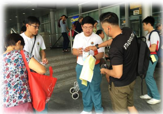
Students approaching members of the public for donations outside Bedok MRT station

The Secondary 3 cohort participated in the Singapore Heart Foundation Flag Day on Saturday, 20 January 2018. Flag Day is part of the school's efforts to contribute to the community. It is also part of the school's formal curriculum to infuse values and develop resilience in the students. The Secondary 3 Flag Day also prepares the students for their service-learning project during the Student Development Week in March.