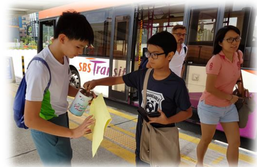
Student approaching a member of the public for donations at Tampines Bus Interchange

A series of sharing was planned for the students to better understand the significance of this flag day beyond just selling flags to raise funds. It was imperative that students appreciate the potential impact that they would have on working for the good of society. This year, the Singapore Heart Foundation had one of its clients to share the heart-felt narrative of how the foundation supported and aided him in his difficult times. The sharing gave students the impetus to do the best they could for the fund-raising.