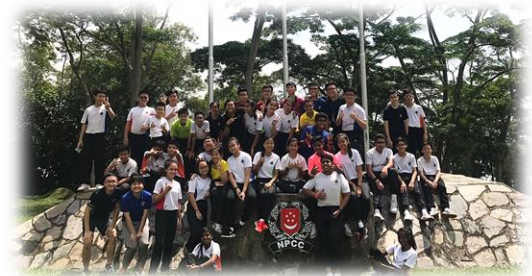
Our 2017 batch of Secondary 2 & 3 cadets who completed their camp at Pulau Ubin