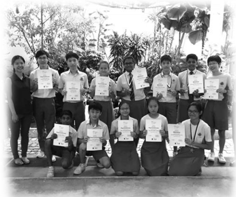
Winners of the International C.B Paul Science Quiz