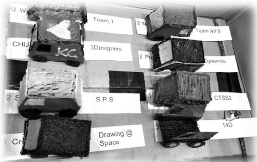
Our students' model 'Dynamite' (second from top right)