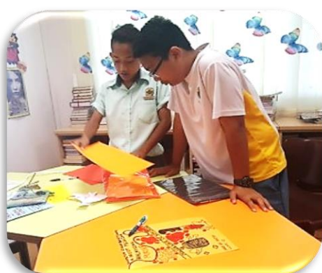
1D students hard at work redesigning and redecorating the library

Based on their earlier proposals, the Secondary One cohort was committed to the implementation of their school improvement projects. Class 1D's project on redecorating and improving the Library was voted the best project.