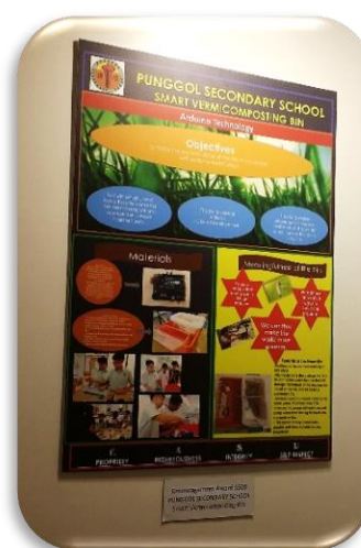
PSS Vermicomposting Information poster board

Organised by Sembcorp Marine, this project aims to involve the community at large, particularly students, to participate in learning about caring and protecting the environment so that they can contribute towards the conservation and improvement of the environment.