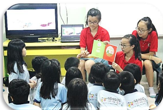
PSS students telling stories to preschoolers