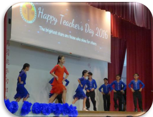
Dance Sport Performance by Secondary One Students

The celebration at the hall was filled with performances and games. Student councillors also handed out the Teachers' Day gift to all teachers – a compilation of heart-warming messages from students.