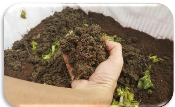
Vermicomposting in process

Their innovative product – “Smart Vermicomposting Bin project for the Community” – has even been shortlisted by Sembcorp Marine for the finals on October 20.