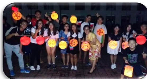
Lantern trail group photo