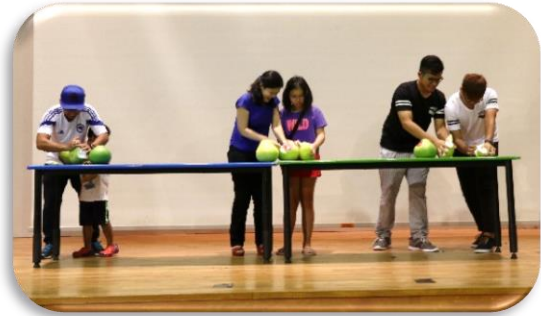
Peel-a-Pomelo competition between Staff, PSG and Alumni

The annual Mid-Autumn Cultural Festival was held on 1 September. It was an evening of festive celebrations with performances and games organised by the Mother Tongue Department.