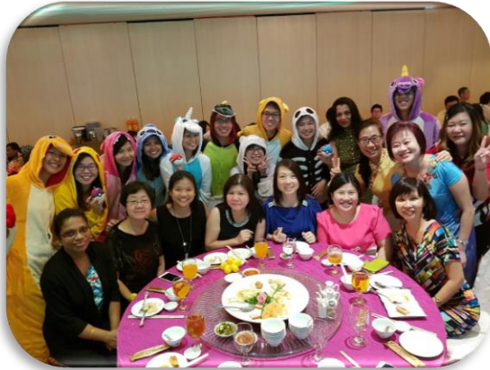
Group photo of Best Dressed Table with PSG

This annual lunch event was attended by SAC members as well as the Parent Support Group.