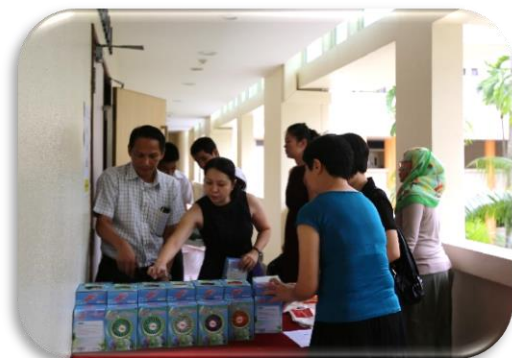
Preparation of door gifts by SWB Committee members

This was followed by a Teachers' Day Lunch at the Civil Service Club at Tessensohn to recognise the efforts of our teachers. The theme was "Colours of the Rainbow" – an apt way to honour the different ways in which our teachers inspire their students every day.