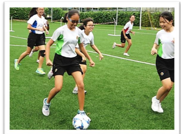
Students displaying sportsmanship

The students engaged in healthy competition and displayed sportsmanship throughout the event. They also demonstrated the school values of Propriety, Righteousness, Integrity and Self-Respect.