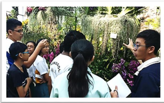
Research for butterfly garden design at the Singapore Garden Festival

The members went on a learning journey to Gardens by The Bay and attended workshops on planning and designing a butterfly garden.