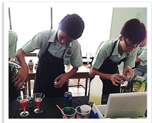
Hospitality students preparing mocktails

The students learned course-related skills and participated in learning journeys to various industries. Our Culinary students were even coached by a Michelin Star Chef during one of training sessions. The programme ended with a showcase of students' newly acquired skills and sharing of their learning experiences with teachers and school leaders.