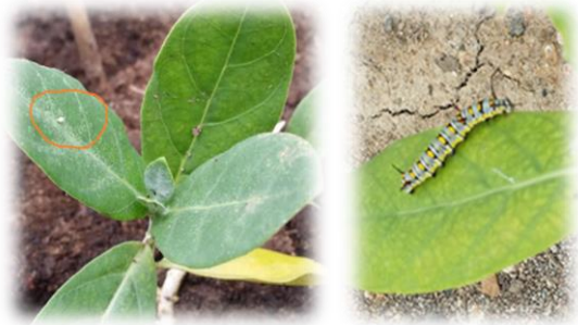
Photo on the left: First butterfly egg Photo on the right: The egg has hatched into a beautiful caterpillar

Through this project, the Environment Club members learnt to appreciate how a small change that they make in their environment can impact the living organisms around them. The members also aim to create in others a greater awareness of the environment and a deeper understanding of our roles in preserving natural habitats.