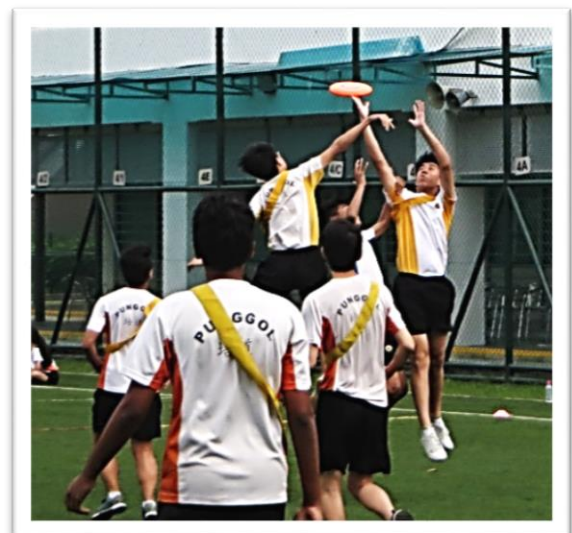
Students demonstrating teamwork