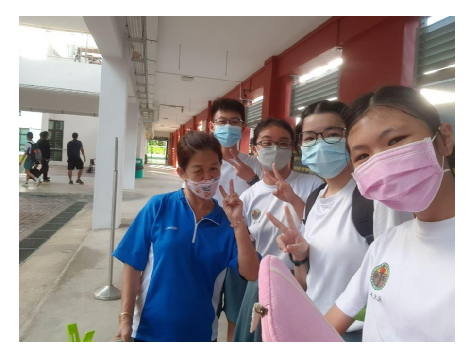
Entry for Our School Our Story photography (OSOS) competition 2022

"During my time in AVA Club, I have learnt many things, such as how to take a photo, edit a video and run a school programme. I would never have picked up all these skills if I did not join AVA Club. I have become more responsible because I would need to show up every morning to set up the microphones for morning assembly and to manage my time better. I also found the CCA's session quite enjoyable as I have made new friends and experiences along the way, where every event posed unique challenges and problems for me to solve. All in all, I find my CCA experience enjoyable and educational."