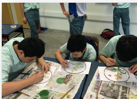
Students painting Chinese Fans during MT Fortnight

For the English Language Week, students were engaged in crafting poems and nanotales (a very short story), playing Scrabble, Charades, and Spelling Bee.