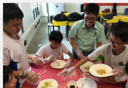
Students learning how to make popiah

Questions to ask Knowledge to seek Curiosity and Adventure Obsessions and selfishness Wisdoms that build a person After all, it is life.