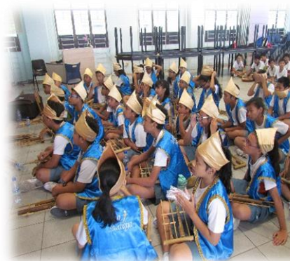
Students learning how to play the Angklung