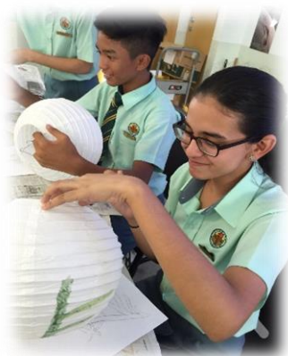
Students decorating Chinese lanterns during MT Fortnight