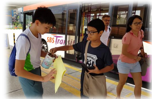
Student approaching a member of the public for donations at Tampines Bus Interchange

A series of sharing was planned for the students to better understand the significance of this flag day beyond just selling flags to raise funds. It was imperative that students appreciate the potential impact that they would have on working for the good of society. This year, the Singapore Heart Foundation had one of its clients to share the heart-felt narrative of how the foundation supported and aided him in his difficult times. The sharing gave students the impetus to do the best they could for the fund-raising.