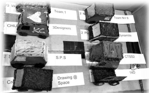
Our students' model 'Dynamite' (second from top right)