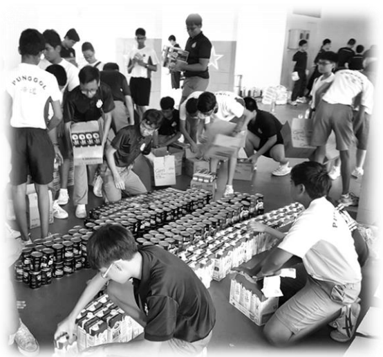
Students preparing the food packs for the elderly and needy