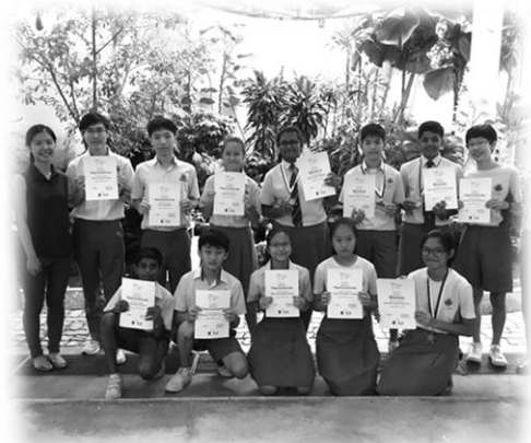
Winners of the International C.B Paul Science Quiz