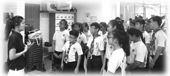
Briefing by a representative from The Food Bank

On 20 May, the four Uniformed Groups (UG) came together for the Annual Uniformed Group Camp. One of the highlights of the camp was the Food Donation Drive. UG members worked with the Volunteer Welfare Organisation, The Food Bank, and raised a total of $6110 from the whole school. With the money raised, the school was able to pledge 591 food packs for the elderly and needy staying in Ang Mo Kio. This far exceeded the initial target of 300 food packs. The UG members took part in the packing and distribution of the food packs to the beneficiaries. Through this meaningful service learning activity, the students exhibited our school values, played a part in giving back to the society and increased their civic responsibility.