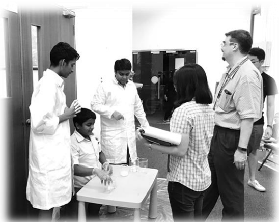
PSS students demonstrating their experiment to the judges

The students demonstrated Chemistry and Physics experiments which were beyond what was taught in their Lower Secondary Science syllabus. The experiments were on iodine clock, refractive index, elephant toothpaste and making cloud in a bottle.