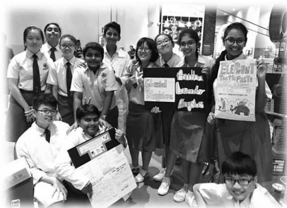
Our Secondary 2 Science Buskers