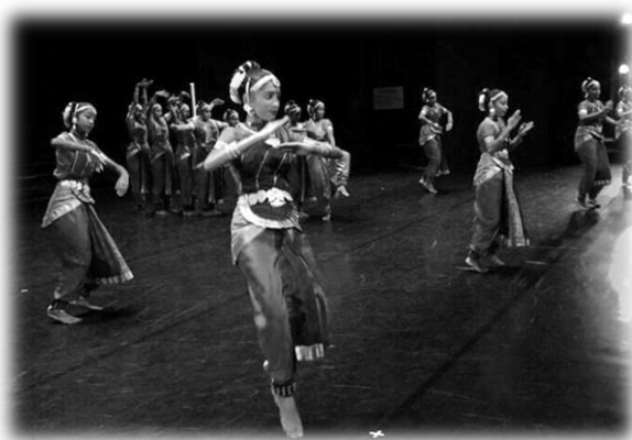
TLDDS dance performance

15 students from TLDDS participated in the Singapore Youth Festival this year. The students danced to a song titled "Shiva Shiva Shankara" from Damarukam. The song is about the power and greatness of Lord Shiva which is composed by Devi Sri Prasad. Their energetic performance clinched the Certificate of Accomplishment.