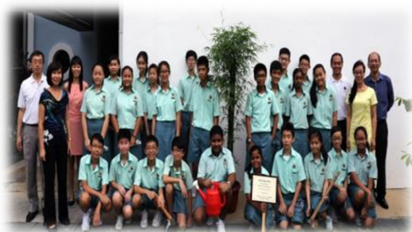
Sec 1 representatives with their cohort tree

As part of PSS’ greening journey, which we refer to as “Project Green Wave”, we planted 4 trees in 2013, one tree to represent each level. Since 2014, a new tree is planted every year on 22 May by our Secondary 1 cohort to show their commitment to care for the environment and to ‘plant’ their roots in Punggol Secondary. This year, as usual, Secondary 1 representatives, together with their Year Heads, planted a tree, the Stone Bamboo ( Phyllostachys angusta ). They placed the tree in the ground, filled the surrounding area with soil, and watered the tree.