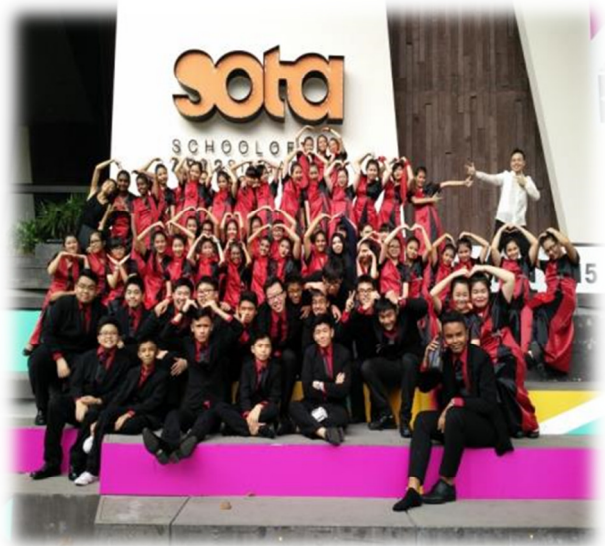
Our School Choir