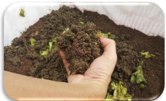
Vermicomposting in process

Their innovative product – “Smart Vermicomposting Bin project for the Community” – has even been shortlisted by Sembcorp Marine for the finals on October 20.