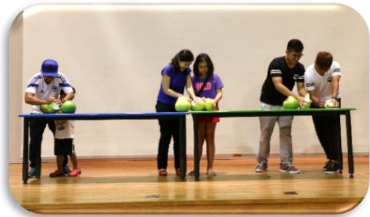
Peel-a-Pomelo competition between Staff, PSG and Alumni

The annual Mid-Autumn Cultural Festival was held on 1 September. It was an evening of festive celebrations with performances and games organised by the Mother Tongue Department.