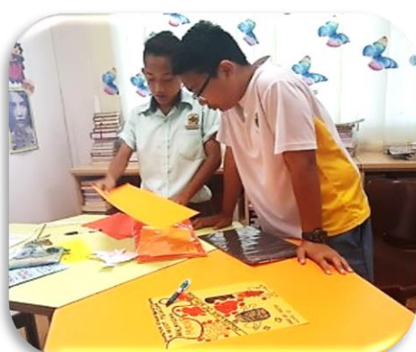
1D students hard at work redesigning and redecorating the library

Based on their earlier proposals, the Secondary One cohort was committed to the implementation of their school improvement projects. Class 1D's project on redecorating and improving the Library was voted the best project.